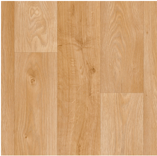
Aspin | 551 U3890.212K551G144