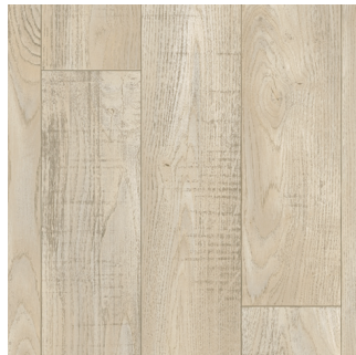
Arcadia | 739 U6040.212K739G144