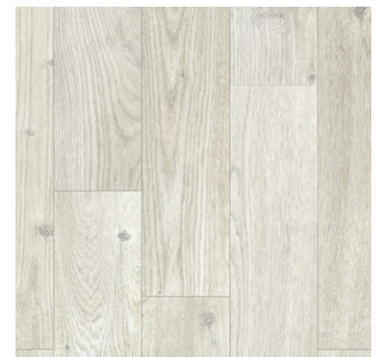
Nice | 793 U1070.212K793G144