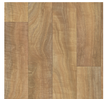
Koala | 715 U5030.212K715G144