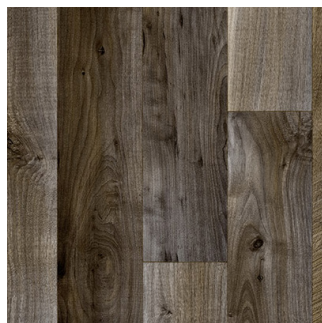
Baron | 713 U6580.212K713G144