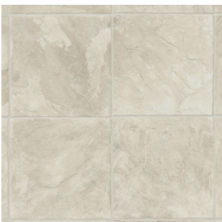
Condor | 535A U3140.212K535G144