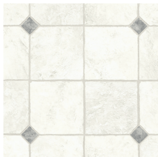
Arezzo | 504 U3700.212K504G144