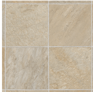
Sandbridge Slate | 594 U5330.212K594G144