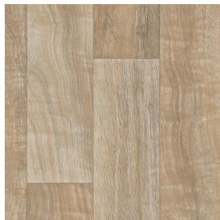
Koala | 746 U5030.212K746G144