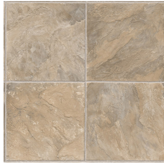
Condor | 564A U3140.212K564G144