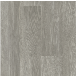
Majestic Oak | 895 U9540.406K895G144