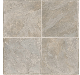
Condor | 573 U3140.212K573G144