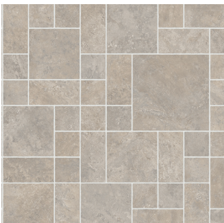
Washington | 596B U9480.212K596G144